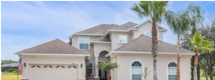
Land O Lakes | SOLD - $485,000