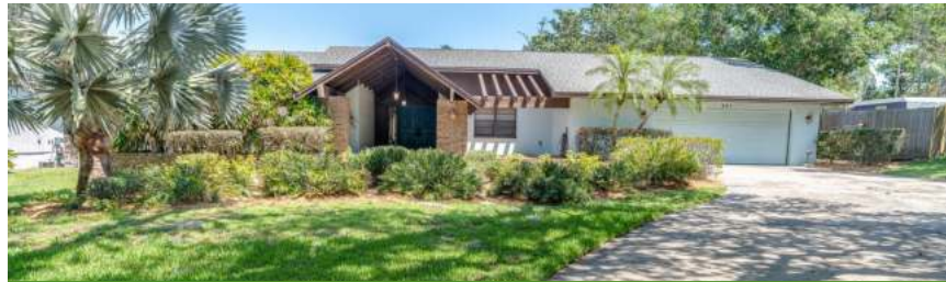
Clearwater | JUST LISTED - $749,000