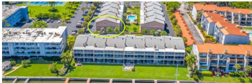
Tierra Verde | SOLD - $365,000