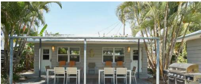
St. Pete Beach | SOLD - $666,200